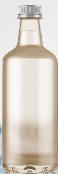
Hemp oil extract in emulsion, 20 mg/serving CBD