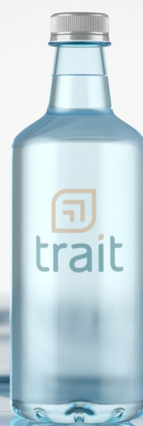
TRAIT Distilled: 20 mg/serving CBD Trait formulation in water

The breakthrough involved more than two years of research by more than 40 scientists and researchers at the company's facility in Los Alamos, New Mexico. The water-soluble cannabinoids are now available in the form of a clear liquid and powder — either of which can be blended into the water and are ideal for the development of premier quality cannabinoid-infused beverages and edible products.