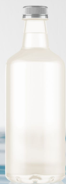
Hemp oil extract in water, 20 mg/serving CBD